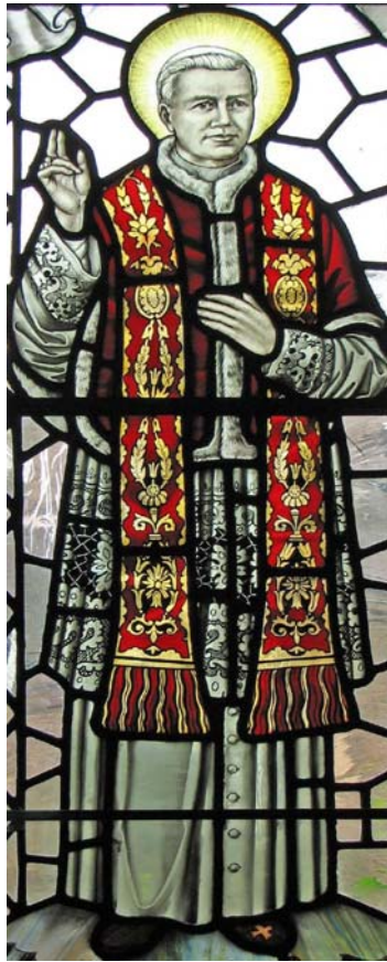
Pope St. Pius X

348 Dudley Road Edgewood, KY 41017 (859) 341-4900 Fax (859) 578-8597 www.stpiusx.com